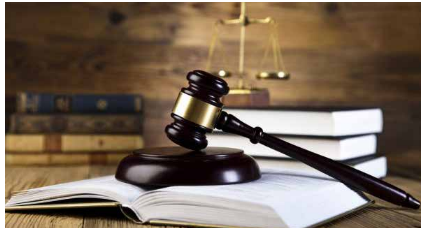
Information provided does not constitute legal advice.

Working for Workers Five Act is not yet law. Local 1059 will continue to monitor the developments on this promising legislation and will be sure to provide insight as new information becomes available ■