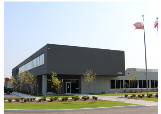
635 Wilton Grove Road, London. The new home of LiUNA Local 1059