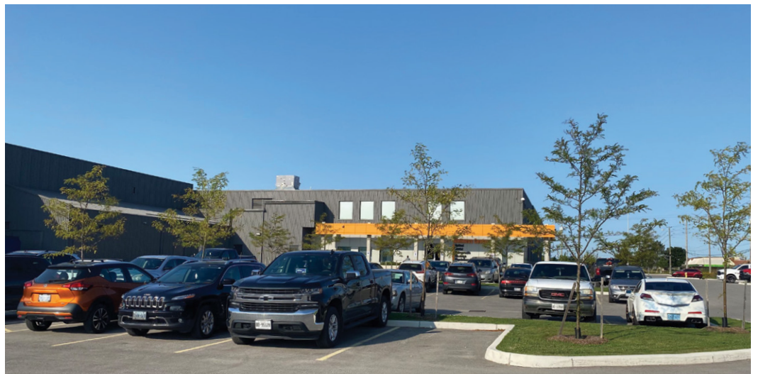
The Wellness Centre at 635 Wilton Grove Road